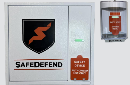
Biometric Safety Cabinet and Activation Module

Activation of LED Text Displays, Emergency Computer Messaging (Computer Desktop), Text to Speech over intercom or Giant Voice speakers, locking or unlocking doors, Instant Mobile Alerting™ or activating other systems are all part of a total solution.